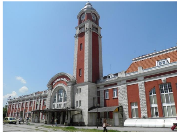
Railway Station in Varna (Bulgaria)

From 6 th to 9 th of March 2017 partners will participate in a study visit in Varna, Bulgaria, to learn about different approaches in the field of sustainable flexible transport – framework conditions, policies and practical examples – and find transferable elements for their own regional context!